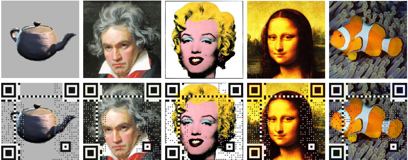
Figure 1: Top: input images. Bottom: photorealistic QR codes with their corresponding URLs.

Tong-Yee Lee National Cheng Kung University tonylee@mail.ncku.edu.tw